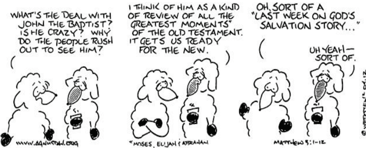
Agnus Day appears with the permission of www.agnusday.org

The 41 st Annual Advent Novena Preparation For Christmas - Strengthen Your Hearts For The Coming Of The Lord Is Near! Nine Daily Masses @ 6:30 am at St. Agnes Church in Waterloo from Fri., Dec. 6 th to Sat., Dec. 14 th . On Sunday, Dec. 8 th attend Mass at your own parish. For info. call Marg @ 519-747-5937.