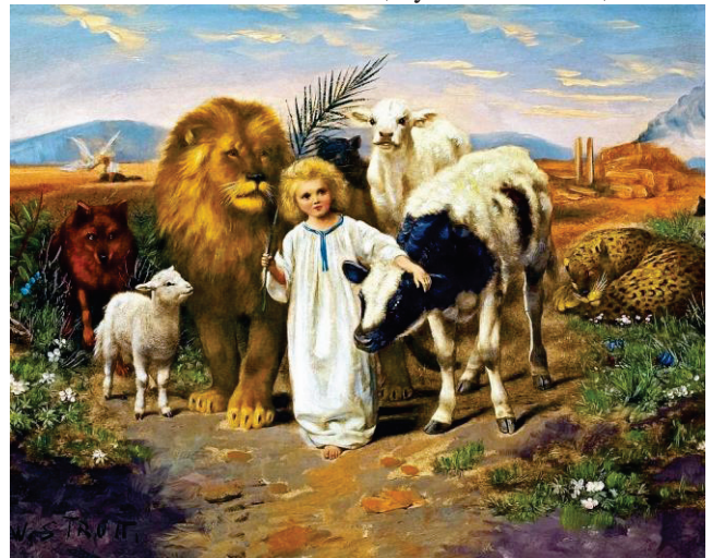
A Little Child Shall Lead Them , by William Strutt, 1900

"The wolf shall live with the lamb, the leopard shall lie down with the kid; and the calf and the lion and the fatling together; and a little child shall lead them. The cow and the bear shall graze, their young shall lie down together; and the lion shall eat straw like an ox....They will not hurt or destroy on all my holy mountain."